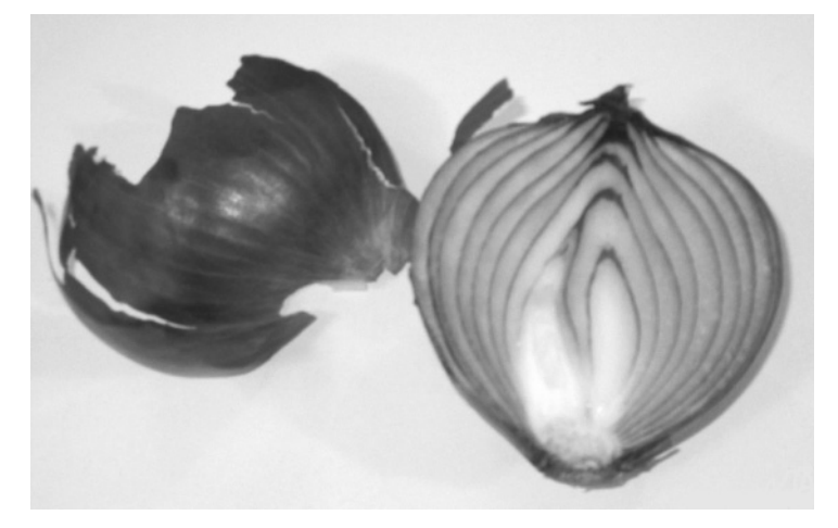
Figure 1-1: The onion analogy of the Torah.

There is a surface story that would be analogous to the thin skin of the onion. Under the thin translucent skin are multiple layers that make up the body of the onion, which is the part we eat. We do not eat the thin skin because it is just the covering for the edible vegetable inside. At the center base of the onion is the heart of the onion that generates the roots, the outer layers, the stalk, and flower. That is where the genetic material which represents the onion. The thin skin is only a poor reflection of the onion. The outer layers of the onion are akin to separate secret coded stories Moses put into the surface story. These stories are about important subjects and events that Moses was trying to convey to us over the expanse of time.